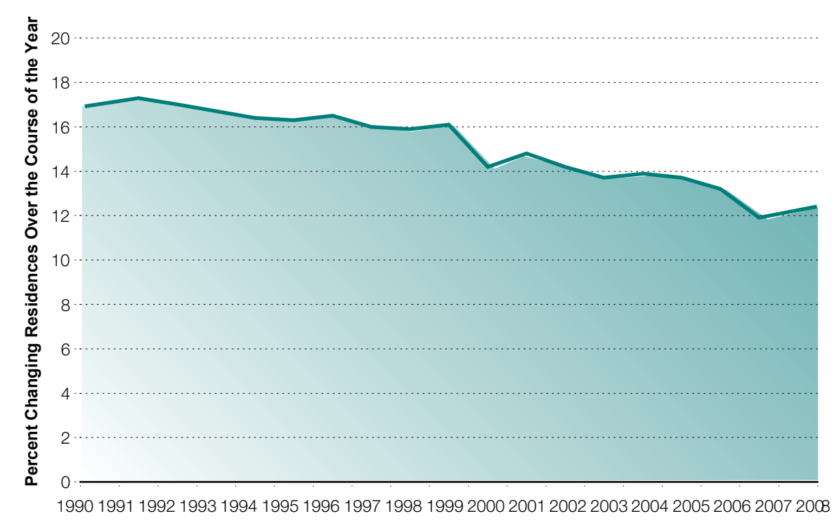
FIGURE 1. U.S. Mobility Rates, 1990 through 2008

Of particular concern is the possibility that the most economically vulnerable U.S. families might be unable to respond to local economic downturns by moving away. Figure 2 shows geographic mobility rates among a national representative sample of people displaced from a job at any point during the period from 2005 to 2008. Specifically, the figure displays the proportion of respondents who have moved to a different city or county as of January 2008.<sup>6</sup> We break out these mobility rates by people's educational attainment, which economists consider to be one of the best indicators of someone's lifetime earnings prospects. The figure shows that around 16 percent of college-educated people who had lost a job had moved at some point following displacement compared to just 10 percent among high school dropouts and 11 percent among high school graduates.