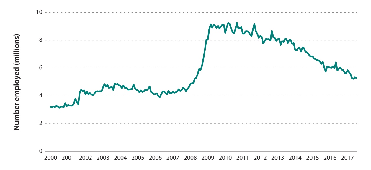
Number of People Employed Part-Time for Economic Reasons, 2000–17

Note: Monthly values are seasonally adjusted.